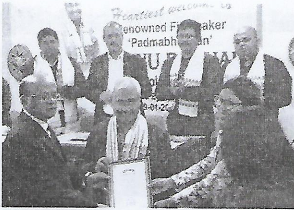
Renowned Assamese film Director of International repute Mr. Jahnu Baruah has volunteered to become BRAND AMBASSADOR of this humanitarian service.